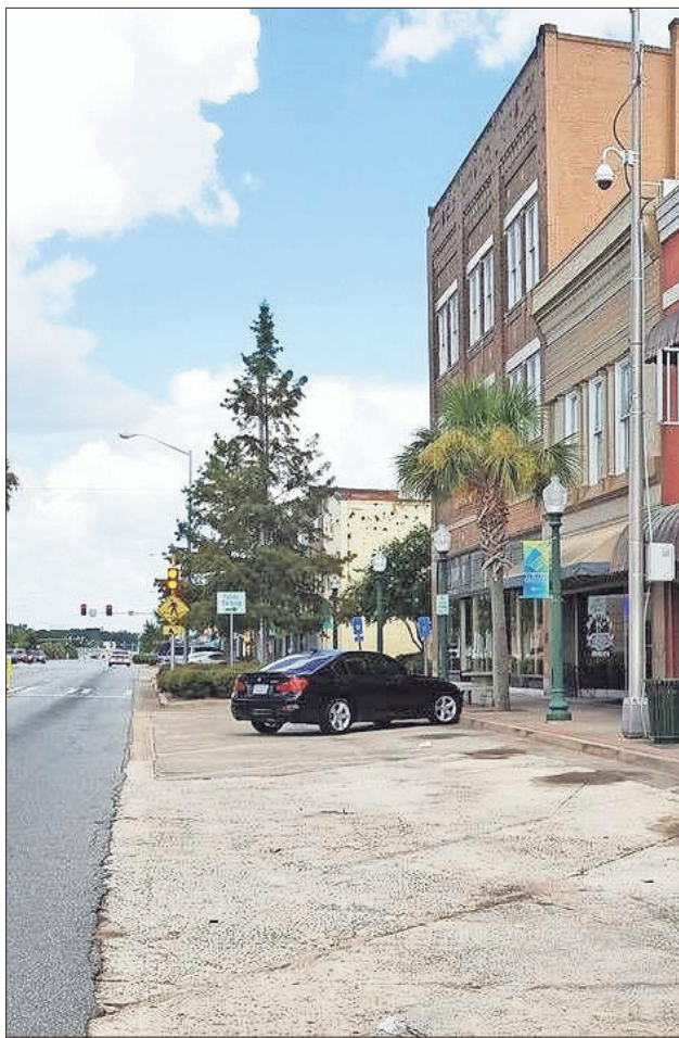
The south side of the 200 block of West Broad Avenue across from the parking deck in Albany, Georgia in 2017.