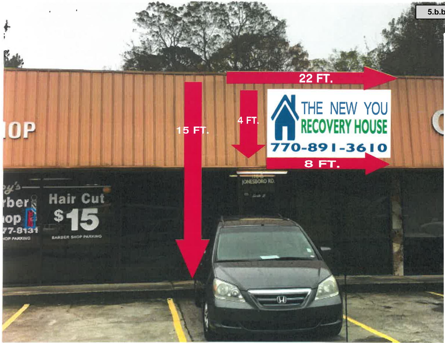
Attachment: Wall Sign (1750 : New You Recovery Sign)