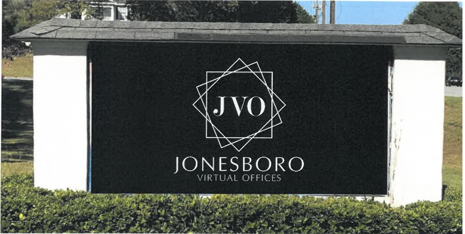
50.2" x 57" vinyl graphics

4'x8' panel mounted onto face of monument