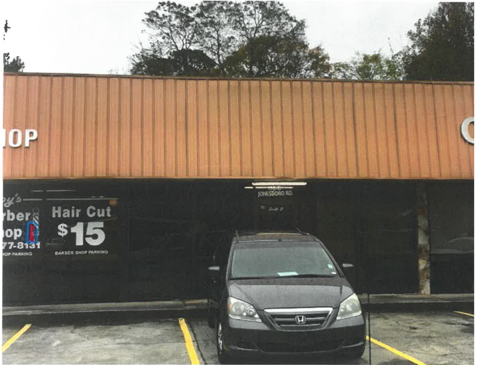
Attachment: Wall Sign (1750 : New You Recovery Sign)